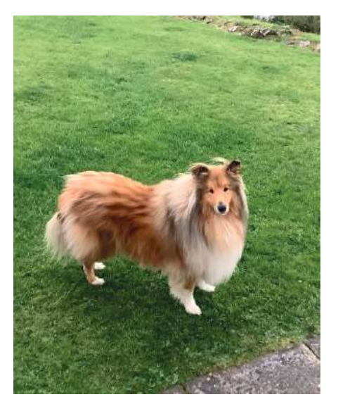
BEST DOG (above). This is Boo, a long haired collie. A beautiful coat and very attentive.