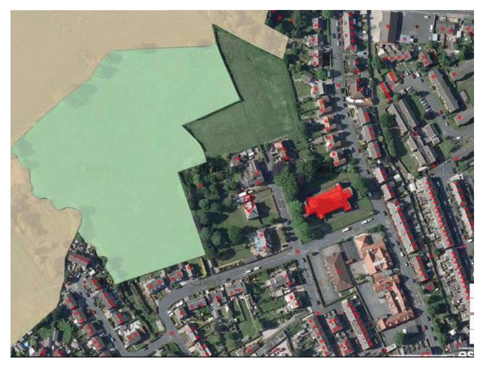
Contact details for Ward Councillors can be found on the back page.

Coppull Parish council will be objecting etc. ... if and when a planning application is submitted.